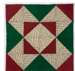
November B OM