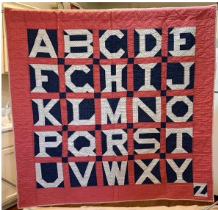
Alphabet Quilt (72" x 76") c. 1870, artist unknown