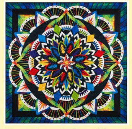
"Peace, Love, & Flower Power" July 26-27, 2024